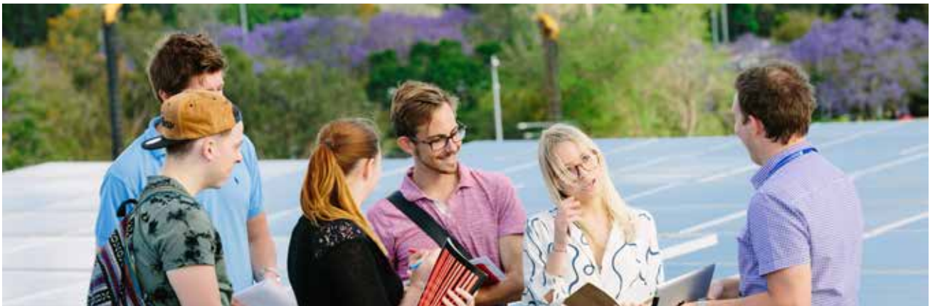
Students at the solar facility at the UQ St Lucia campus.